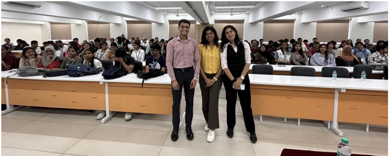
Img-10: Alumni with student participants.

Professor-in-Charge, SAS, HSNC University