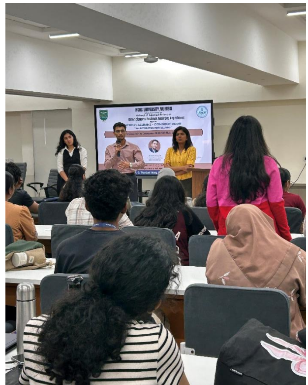
Img-8: Alumni responding to student queries during the Q&A session.