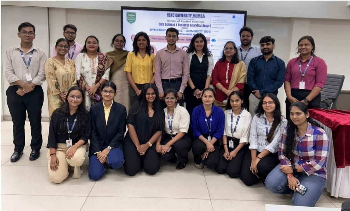
Img-9: Group photo of alumni with faculty and the Placement Cell team.