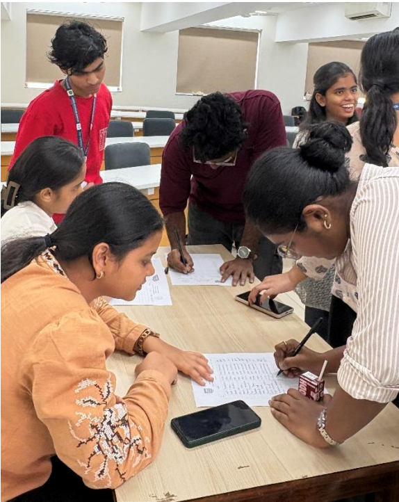
Img-1: Registration of the students